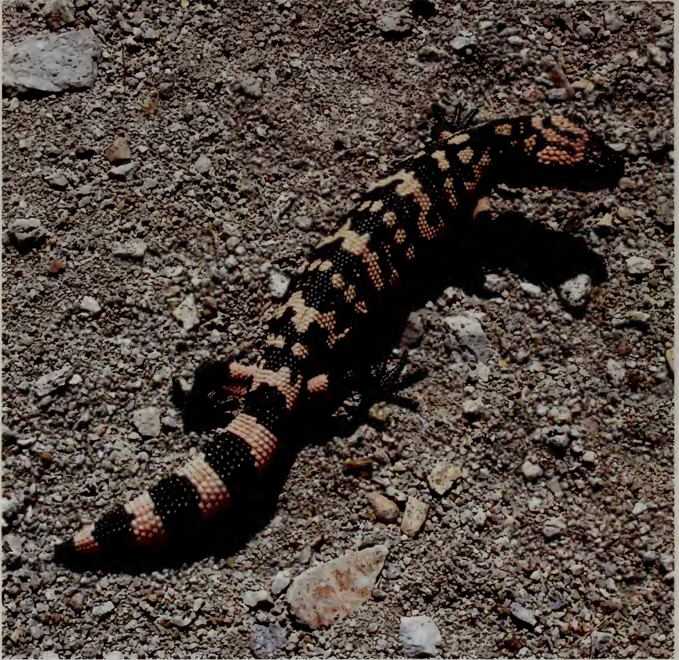
Fig. 8. Gila monster from the Kingston Range, San Bernardino County, California. Details of the sighting will be reported elsewhere. LACMPC #1439.